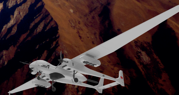
MARITIME PATROL VARIANT