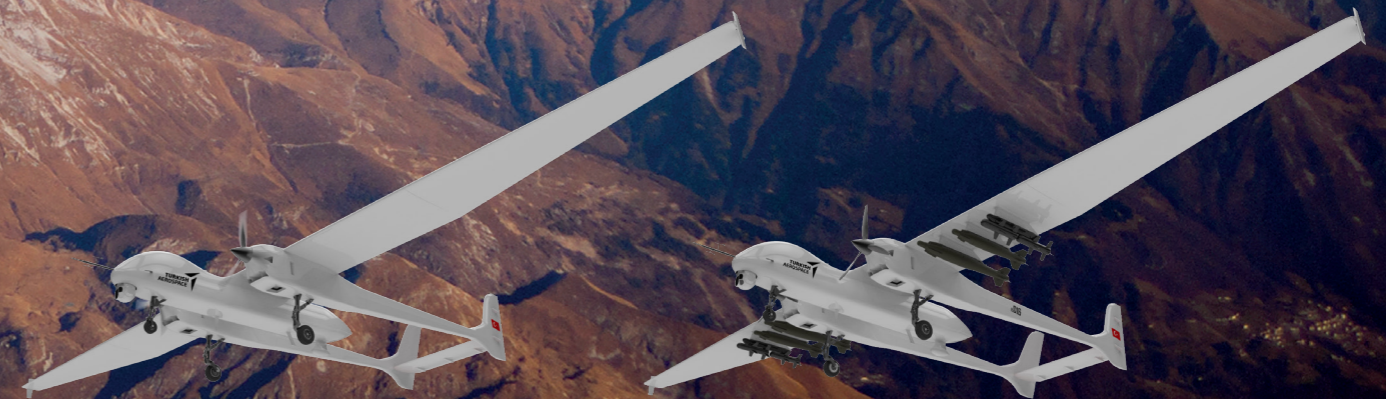
SURVEILLANCE AND RECONNAISSANCE VARIANT